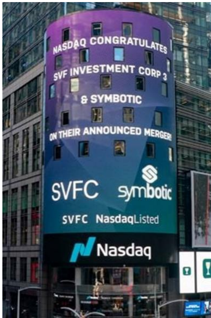
© 2020 Symbotic. All rights reserved. Proprietary and confidential. For internal distribution only.